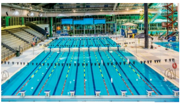
Completed 50 m pool at the Adelaide Aquatic Centre